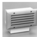
L252W-L26-J 5-5/8" x 9-3/8"