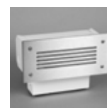
L158W-N-J Stainless Steel