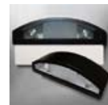
L2500W-1-EGR FannyPack Egress