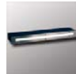
L512W 1-9/16" x 15-3/4"