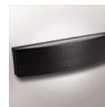
L2600W-2-ST/ST FannyPack XL