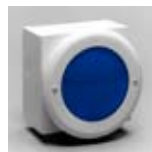
L150G/PA-BLU 5-3/8" dia.

Detailed product sheets with photometric data are available for the Steplites illustrated in this overview. www.colelighting.com