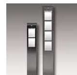
C1392D-LED-2 C1392D-LED-4 2 and 4 window 12-3/4" x 2", 16-5/8" x 2"