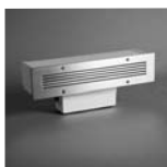
L2158W-N-J Stainless Steel