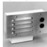
L252-N-CO-J 5-7/8" x 11-5/8"