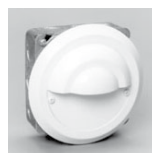
L150E 5-3/8" dia.