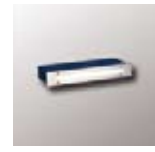
L506W 1-9/16" x 9-3/4"