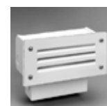
L158W-SCL-WHT-J Sharp Cut-off Louver