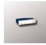
L503W 1-9/16" x 6-3/4"