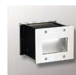
L603W-2S-N 4"x5" Thru-wall