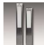
C1392W-LED-2 C1392W-LED Two sizes shown 14-3/16" x 2", 12-3/4" x 2"