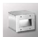
SL603W-N 4"x5" Surface. Also available in: L606-L609-L612 sizes