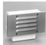
L252-N Stainless Steel 5-5/8" x 9-3/8"