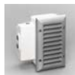
L252W-L26V-J 9-3/8" x 5-5/8"