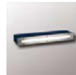
L509W 1-9/16" x 12-3/4"