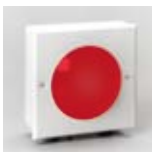
L150G-RED 5-3/8" sq.