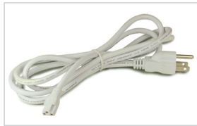
NUD Series 72" Cord & Plug

Hardwire box used to power NUD Series using Jumper Cables or NUA-404 Hard wire connector. Includes on/off switch. L: 6-1/4" W: 3-5/8" H: 1"