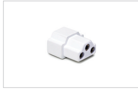
NUD Series End to End Connector

Converts NUD Series LED fixtures from hardwire to direct plug-in units using connector pins on end of NUD unit. Grounded plug.