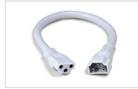
UD Series Jumper Cable

Used to seamlessly join two NUD LED fixtures. 3-Wire grounded connector. One included with each LEDUC unit