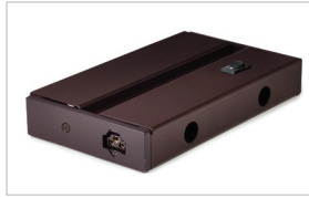
NUD Series J-Box