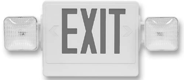
Attractive low-profile design allows for mounting above doors and restricted spaces. The EL90 offers full 180° lamp rotation to fit any application.